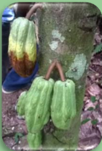
Symptoms on young fruits